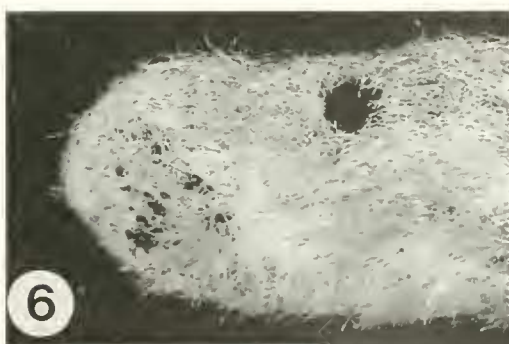
Figs. 1–6. Host plant damage, egg, and adults of Pituis antillanus . 1, Adult feeding damage on the host plant, Tournefortia gnaphalodes . 2, Adults on leaves of the host plant. 3, Exposed egg which had been oviposited through a split in the leaf surface. 4, Cross-section through a leaf exposing two mines in leaf mesophyll tissue. 5, Exposed mine of late instar on a section of leaf. 6, Emergence hole of adult.

ture larvae seemed to go from terminal to basal positions respectively, with adults in the lowest leaves. Examination of more T. gnaphalodes on St. Thomas yielded concurring observations. No larval mortality from either parasites or pathogens was observed in field collected leaves.